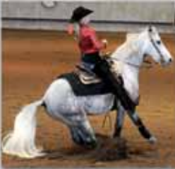
(Left inset) WINTER MOON PHENOMENON , 2003 grey gelding sired by Winter Moon Enlightenment. He is a 5 time Grand National Reining Champion.