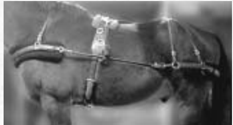
The harness is set up to accustom the horse to wearing a harness. Note the connection from the breastplate to the breeching, using a straight side rein. This set up would be used while leading, lunging, or ground driving your horse.

time comes to more precisely determine your horse's job. There are some jobs where size does matter. Pulling larger vehicles, for instance, is easier for large horses or pairs. One of the best-kept secrets in the driving world is the use of smaller Morgans (14.2 hands and under) in the pony divisions of carriage driving competitions, both Combined Driving Events and Pleasure Competitions. The driving heritage of the Morgan breed serves them quite well in competition against the pony breeds. Size also may matter if your equipment does not match your horse well. Some vehicles simply may be too heavy for younger, unfit, or smaller horses.