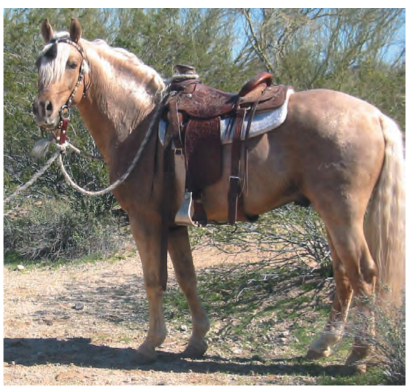
Antigua Corazon de Oro 148744

Bay and brown silver foals have a red or chocolate body, a grayish mane and silver tail. As with most black-based newborns, the lower legs are light colored and the leg points are not fully