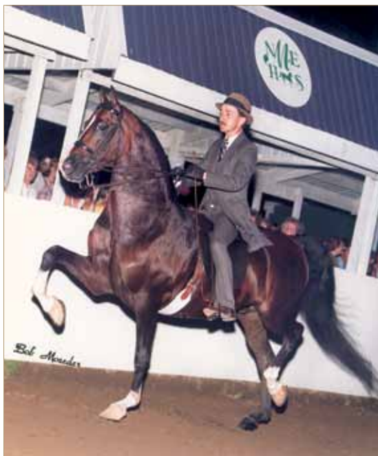
(Above and right) Cedar CreekHarlequin.