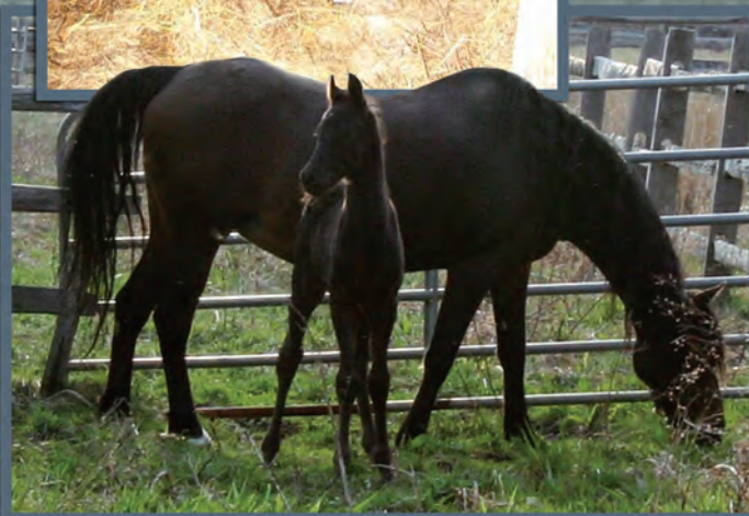
Top to bottom: Prelude To Passion with CBF Double Down ; Slip Into Silk and RWF Cinco De Mayo ; Cherries Wild with colt by Stony Hollow Ice Man.

attention in the show ring, they would go on to be even more acclaimed for their prowess as producers.