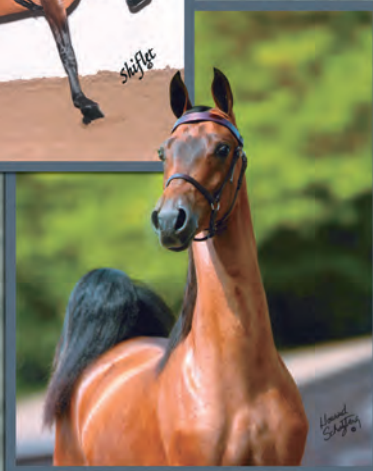
Top to bottom: MKS Destiny's Echo ; On Center Stage ; Delusions Of Grandeur ; MEM Shock And Awe

as MEM Shock And Awe (x AFF Evening Episode) and SPR Chanel (x Ultras Formal Request), start to live out their birthright.