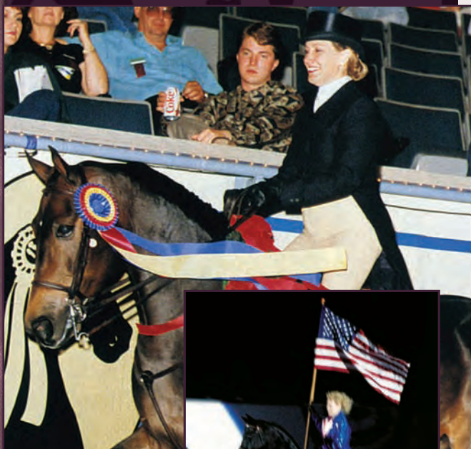
UVM Valcour (above) and Beam's Nighthawk (right) have both been inducted into CT Hall of Fame.