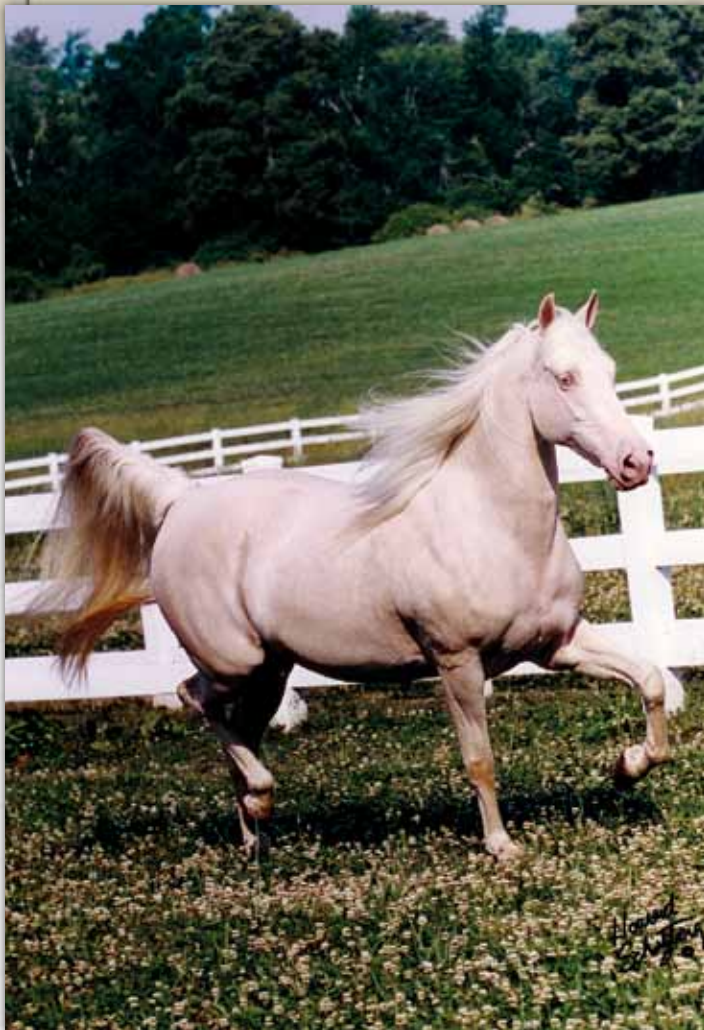
The cremello, GOLDTREE STARLITE EXPRESS (Carrollton x Goldtree Athena)