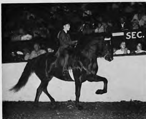
ORCLAND GAYSTAR Ulendon x Orcland Gaylass

We are proud to present these three 3 year-olds—representing our first full year of showing our own stock since our 1958 fire.