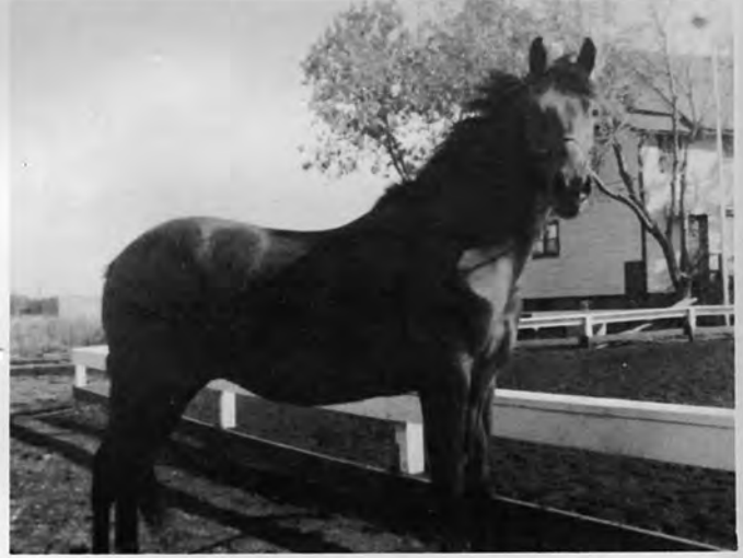
GAY NIP , a good 2 year old half-Morgan gelding.