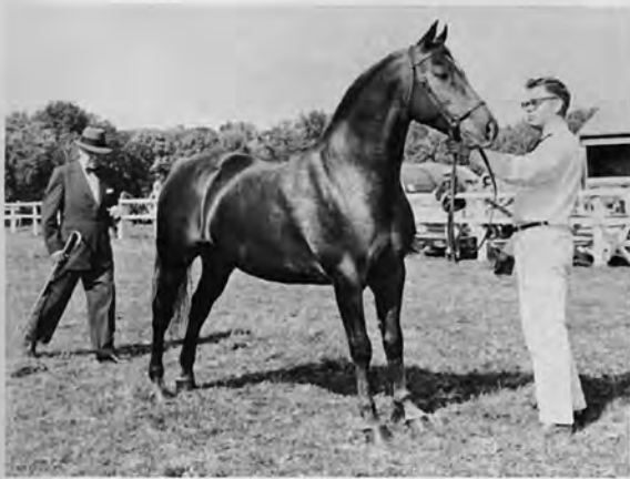
MOR-AYR SUPREME , Grand Champion Stallion at North Central Show, owned by W. F. Honer.