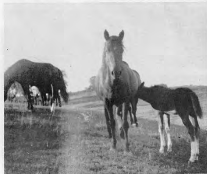
A familiar scene at Moro Hill Morgan Farm. The mare is Moro Hill's Morine (Lippitt Moro Ash x Lippitt Gay Locket) and her foal by Moro Hill's Prophet (Dyberry Ethan x Lippitt Rita Roy).