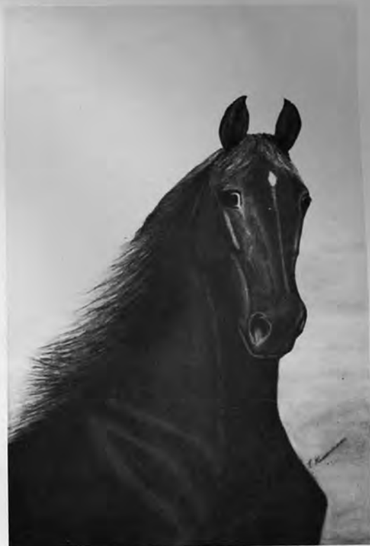
Portrait of HYLEE'S TOP BRASS , done by Edith Kinsman of Chicago.