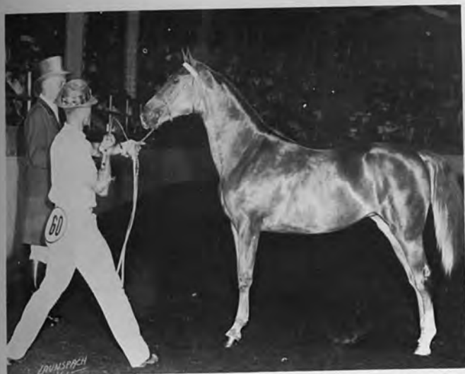
HYLEE'S SPLIT SILK (Billy Burkland x Hylee's Lady Justin) 1961 Reserve Champion Yearling Morgan Futurity, owned by Hylee Farms, Cambria, Wisconsin.