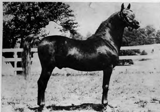
O. C. R. 9099 Captor x Roz Now booking for 1962.