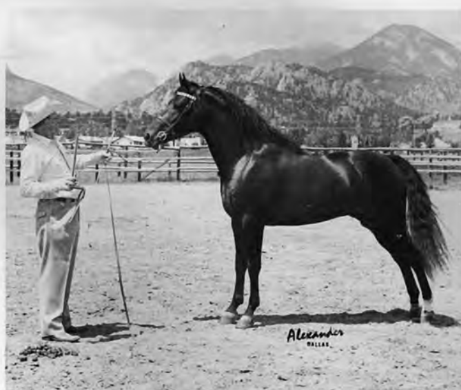
WINDCREST PLAY BOY (Upwey Ben Don x Liz Taylor), Grand Champion Stallion in Morgan Division at the Brighton, Colo., Horse Show.