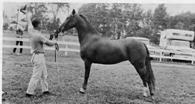
GREEN HILL'S SHARON , Reserve Junior Champion Mare.