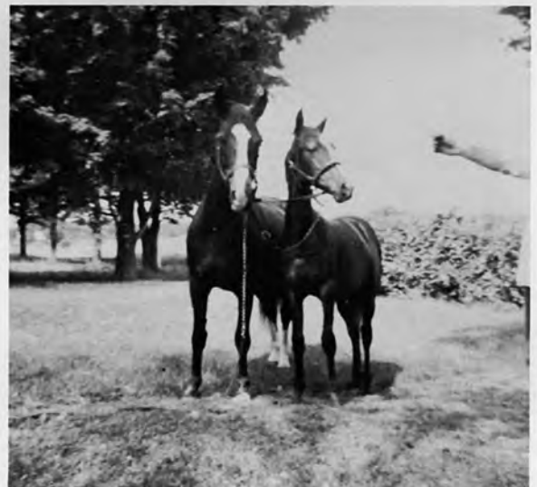
LARITA and GLORY "B", owned by Colbrook Morgan Farm Foster, Quebec