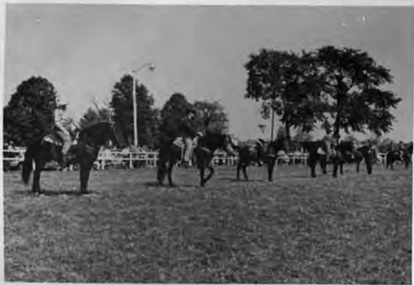
Morgans lined up for judging at North Central Morgan Show.