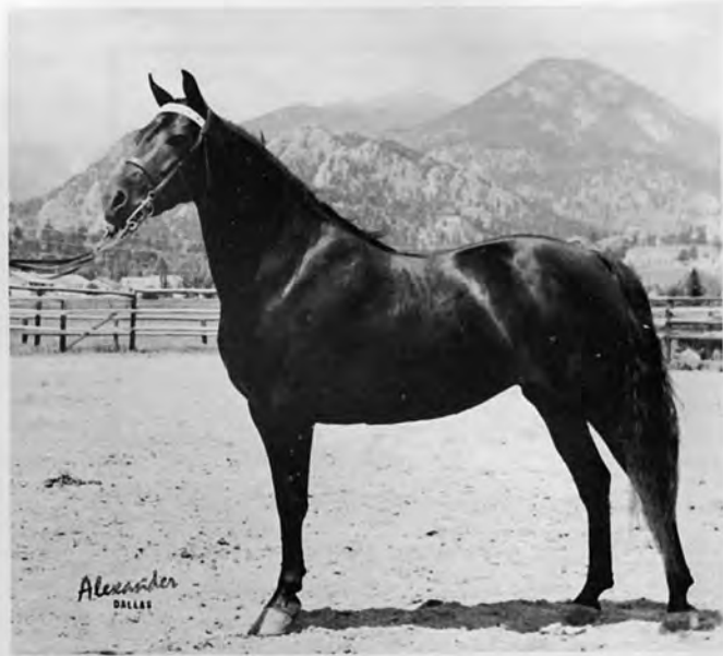
WIND-CREST FIRST LOVE (Upwey Ben Don x Mademoiselle of Windcrest) Grand Champion Mare of the Morgan Division at Brighton, Colorado. Owned by Big Bend Farms, Rockford, Ill.