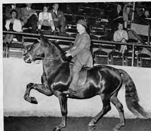
U.N.H. GAYMAN Orcland Gayman x Silkolene