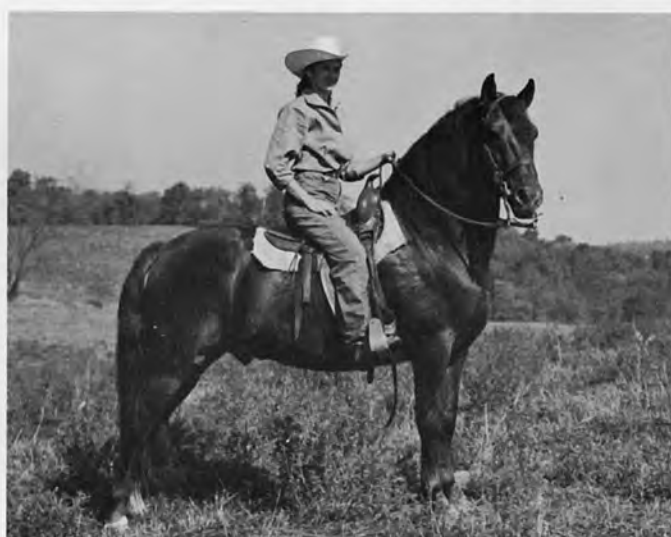
DEVAN DIAMOND (Captor x Gargylus) in every day clothes, owned by Maxine Kidwell.