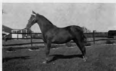
FREEMAN'S JUNE MORN O. C. R. x June Mischief Champion Yearling Filly Ohio Morgan Horse Futurity 1961