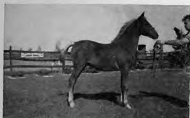
FREEMAN'S ROCKFIRE O. C. R. x Kaki Bon Champion Weanling Ohio Morgan Horse Futurity 1961