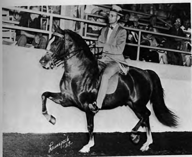
EMERALD'S SKYCHIEF , 5th place Morgan 3 gaited under 15 hands, owned by Emerald Acres Morgan Farm, Manteno, Illinois.