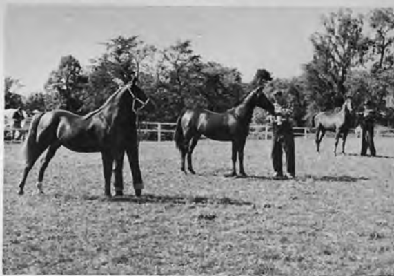
Yearling fillies at North Central Morgan Show.