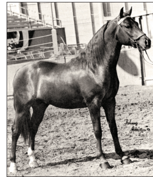
CLOCKWISE FROM LEFT: Red Flash, the last stallion in direct male descent from Bulrush, and Red Flash's son Rhed's Fable (x Falene by Fleetfield).