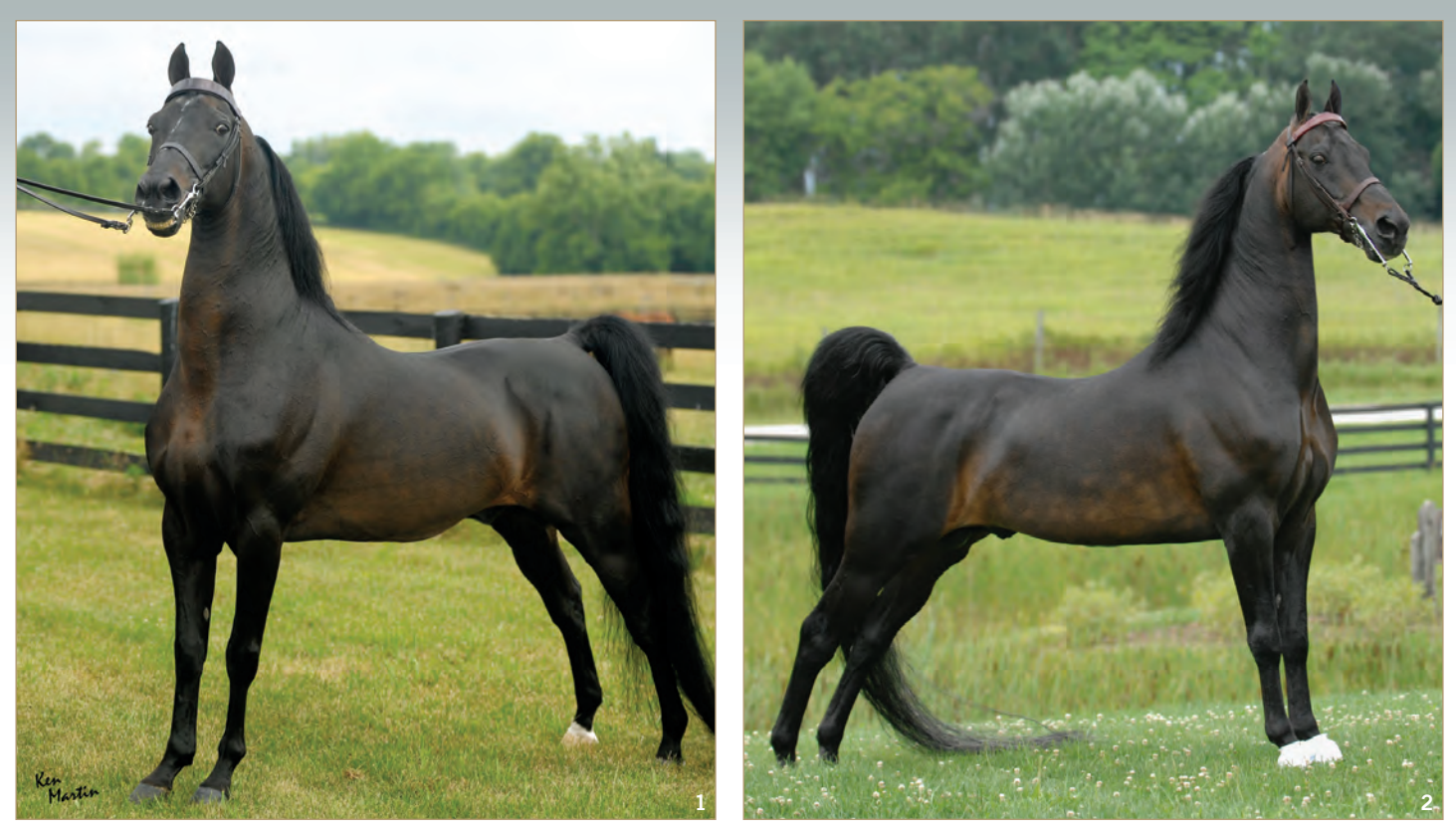
Mizrahi (1) looks a lot like his sire, HVK Bell Flaire (2).

the January 2006 trip she took to purchase a breeding stallion for her family's farm back in Kentucky.