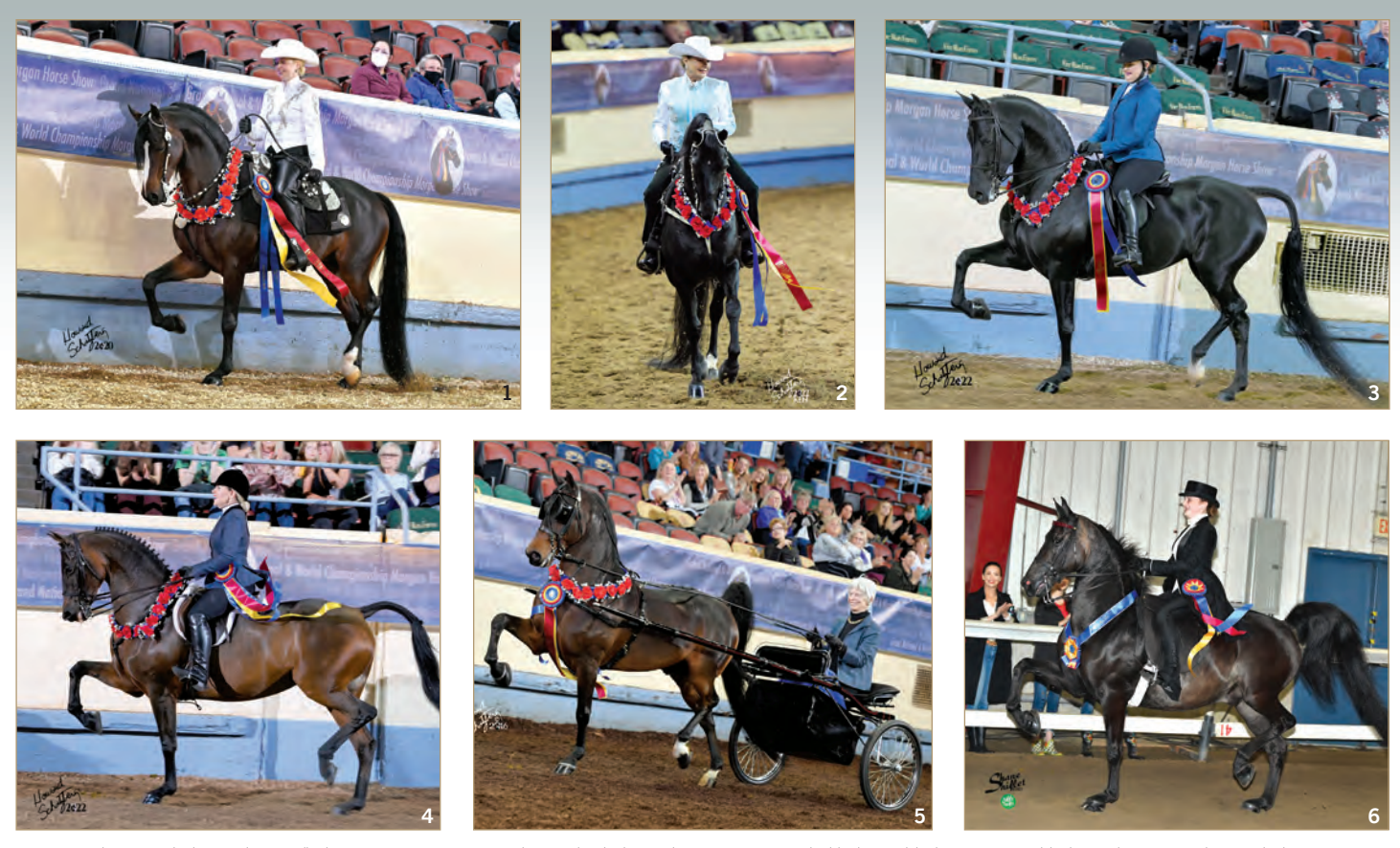
VERSATILE GET WHO HAVE KEPT MIZRAHI AT THE TOP OF THE SIRE RATING Examples of high-ranking Mizrahi get with diverse talents include: Detweiler's Mizteri Man (1) and Treble's Patent Pending GCH (2) (Western pleasure); TDM Excelsiora GCH (3) and The Fashionista GCH (4) (hunter pleasure); Acorn Ridge Dutch Design GCH (5) (classic pleasure driving); and Lexington Steel GCH (6) (saddle seat equitation).

classic pleasure horses, and Morgans showing in harness, in-hand, and under saddle. Get like Western pleasure horses Treble's Patent Pending GCH and Faragamo GCH, hunter pleasure horses The Fashionista GCH and TDM Excelsiora GCH, and classic pleasure title-holders Lexington Steel GCH and Acorn Ridge Dutch Design GCH have racked up bounty for their sire.